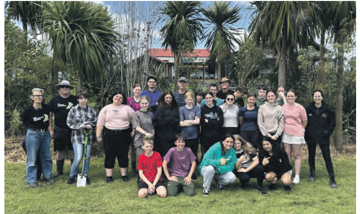
ABOVE: Taku Wairua programme Te Aroha College students at the August St reserve.