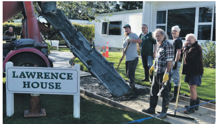
ABOVE: Bowers Concrete donated the concrete to lay a new path at Lawrence House.